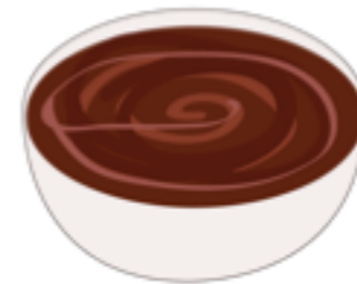
in melted chocolate