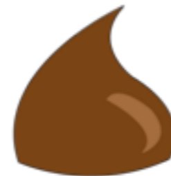
a chocolate kiss