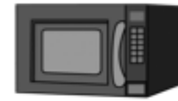
in the microwave