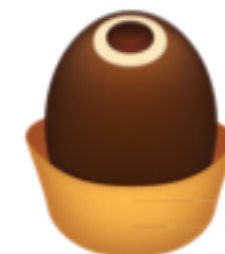
to a chocolate cherry